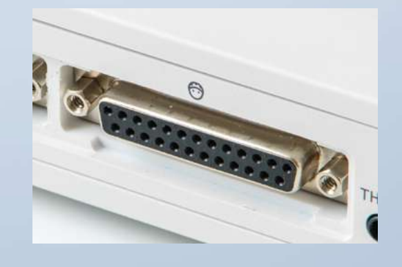
The appropriate connector makes it possible to use electrode caps of various manufacturers.

The device provides 39 referential channels to acquire the high-quality EEG. These channels can work both in AC and DC modes.